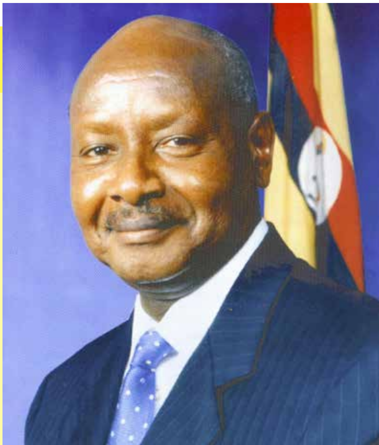
His Excellency Gen. Yoweri Kaguta Museveni The President of the Republic of Uganda THE VISITOR