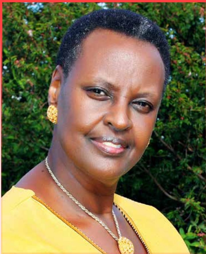
Hon. Janet Kataaha Museveni First Lady and the Hon. Minister of Education and Sports GUEST OF HONOUR